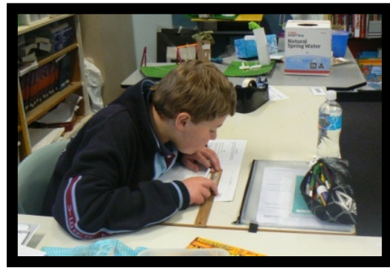
Maths – Problem solving