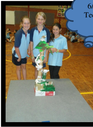
6/7 Team Technology