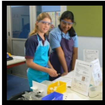
Science – Solids, liquids and gasses