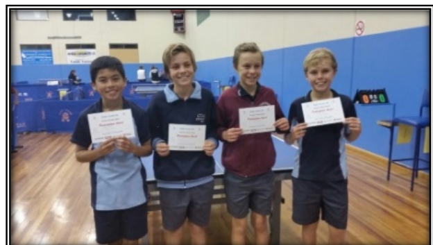
SAPSASA Table Tennis