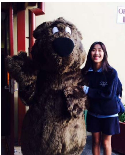
The Very Cranky Bear (aka Darcy) was a smash hit at the Book Fair!

Story time – Several of our classes participated in the National Simultaneous Story time last Wednesday (27 th May) and enjoyed hearing the fabulous Brothers Quibble by Aaron Blabey. Many of our classes did this as a buddy activity and it was very great to see so many of our students enjoying this annual event.