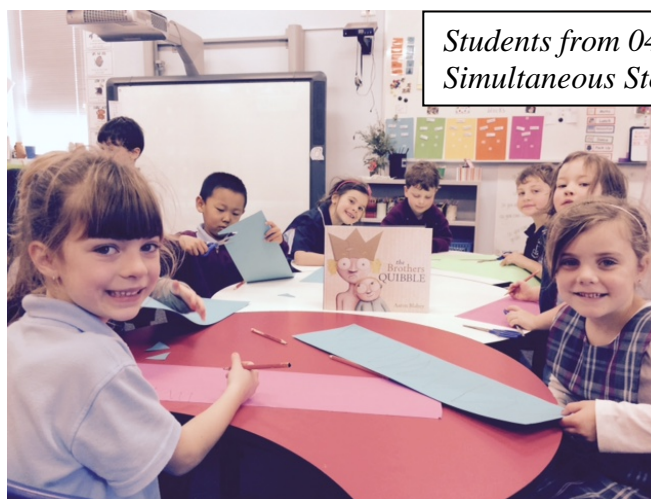
Students from 04 enjoying a National Simultaneous Story time activity.