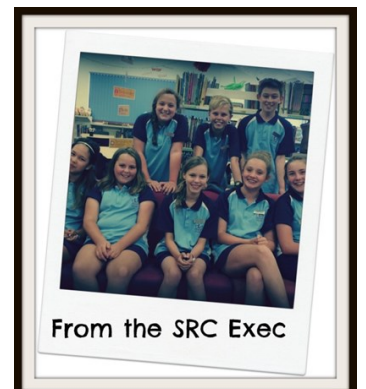
From the SRC Exec

Monday, Tuesday and Wednesday and at the door of the discos.