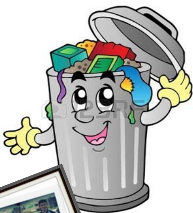
From the SRC Exec

THANK YOU FOR HELPING TO KEEP OUR YARD CLEAN AND HEALTHY